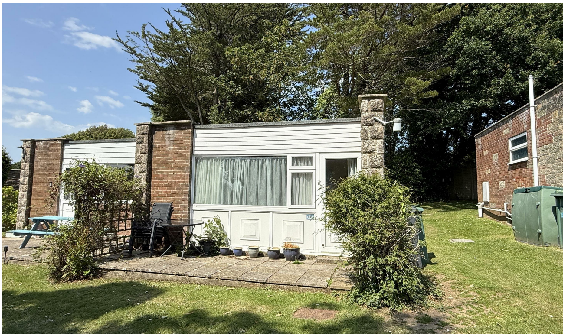
10 Gurnard Pines, Cockleton Lane, Gurnard £58,000